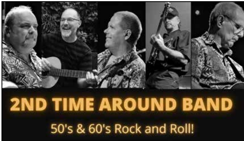
WEDNESDAY, AUGUST 21, 2024 ROCKIN' THE SUMMER NIGHT Band: 2nd Time Around Band Reservations open on August 1st Featuring music from the golden era of rock & roll. Timeless... absolutely timeless! This band has been entertaining locally for many years, with their Rockin' music and wit. You will not want to miss this finale concert!