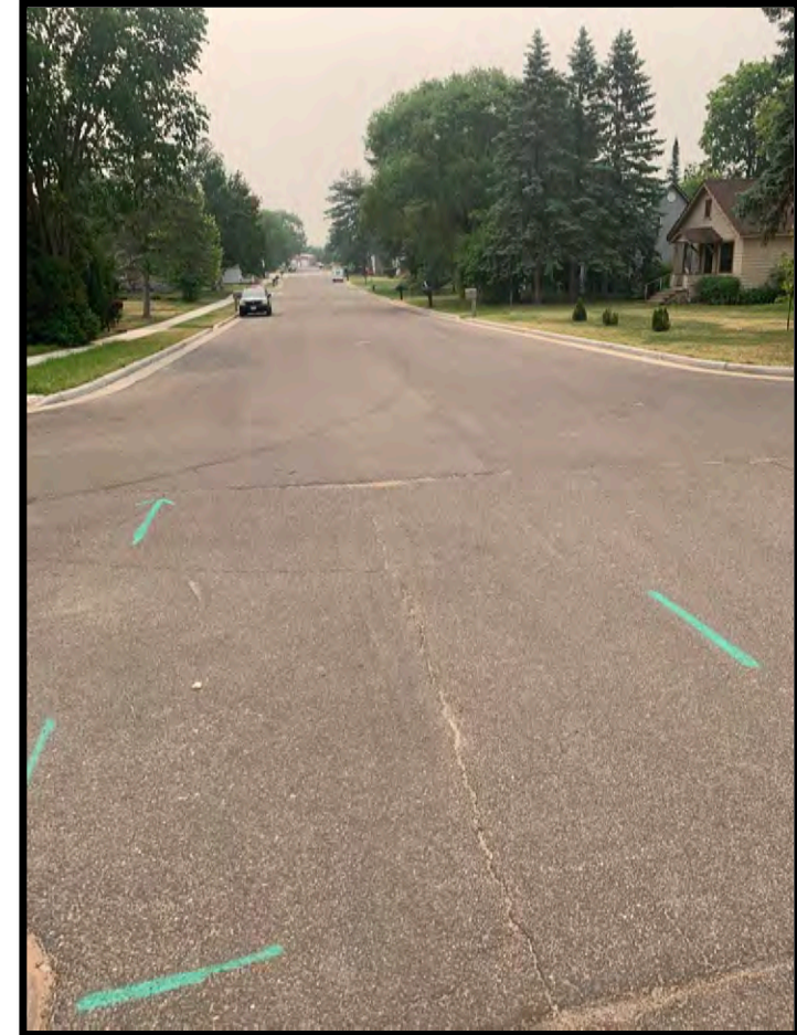
County K – City of Spooner