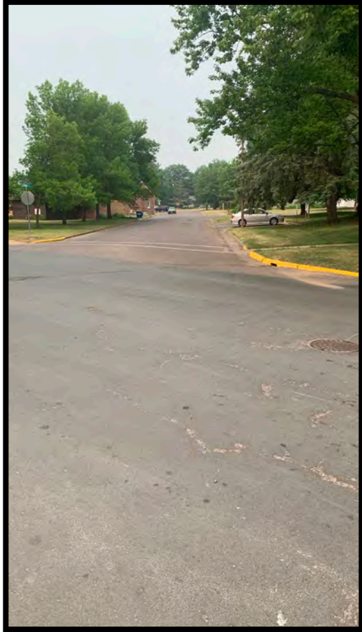
Excessively wide intersections