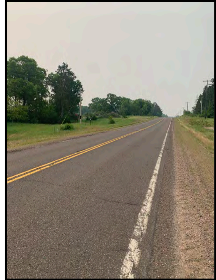
County K – Town of Spooner